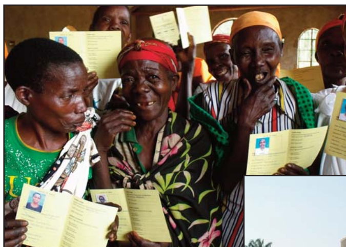
Left: the distribution of medical cards in Buye diocese Below: the consecration of the new cathedral in Rumonge diocese

Today..... A newly built Cathedral for the Diocese of Rumonge is consecrated; a small