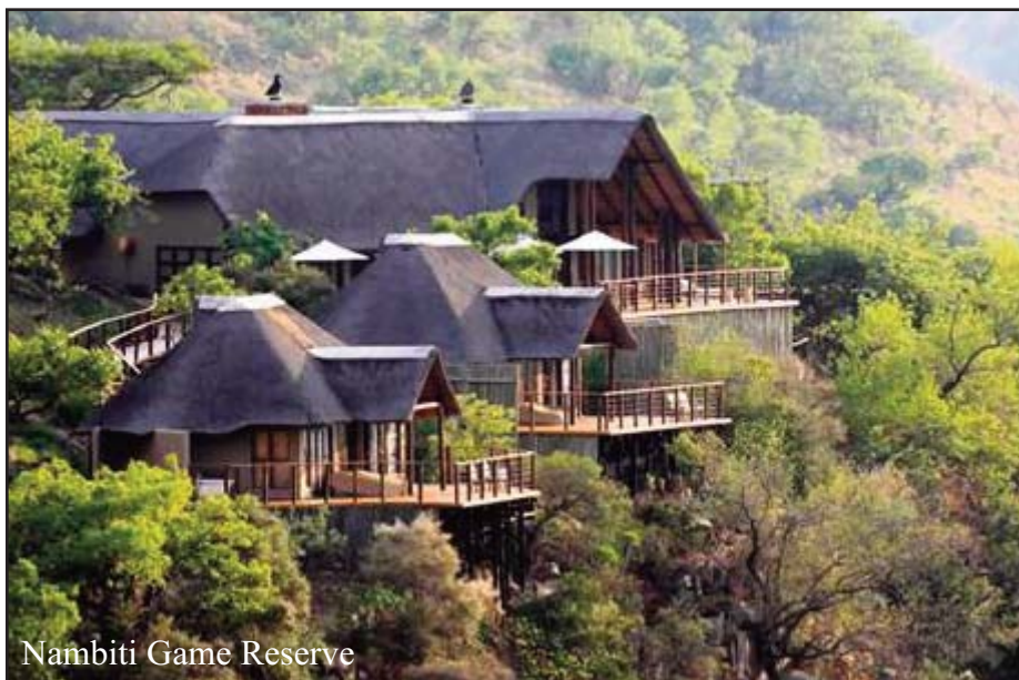
Nambiti Game Reserve