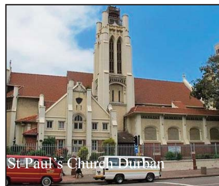
St Paul's Church Durban