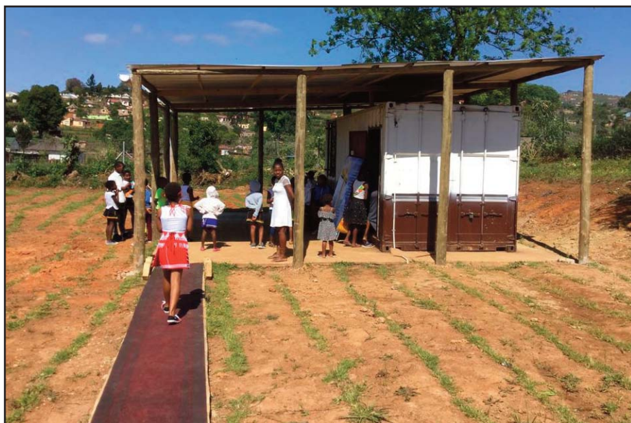
KwaVumelani being used just before the blessing. They are also hoping to grow an English lawn around the container.